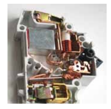
A copy of a Hager circuit breaker with a massive steel arc