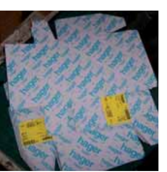
Hager packaging counterfeits.