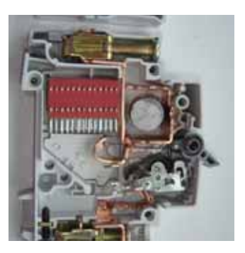
A counterfeit of a Hager circuit breaker without magnetic and