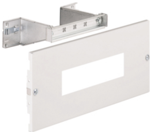
MCB kit, quadro.system, 150x350 mm