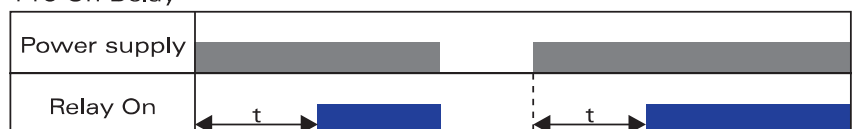
T10 On Delay