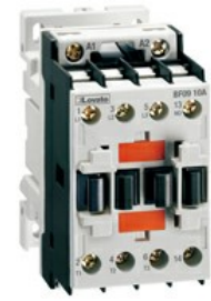
Power contactor BF09