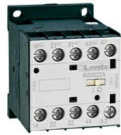
Auxiliary contactor BG00